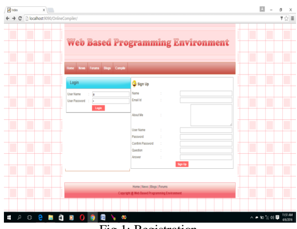
Fig 1: Registration

The Proposed System includes User Registration Form. It consists of UserId and Password. Once User is authenticated, new window is open which consist of In figure: 3, there is a process for JAVA program different options for Programming Language. The proposed system provides better reliability, integrity and security as compared to the existing system.