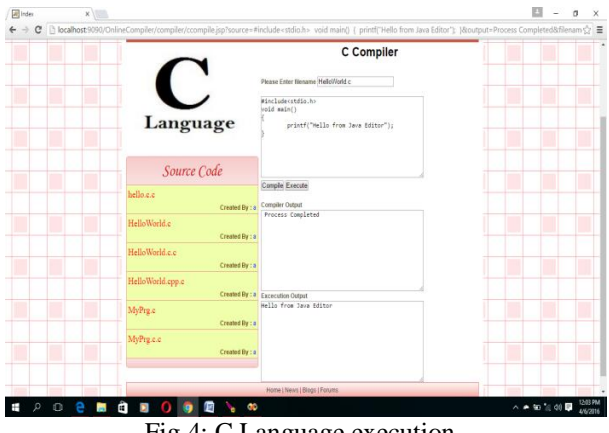
Fig 4: C Language execution.

In figure: 4, there is a process for JAVA program compilation and execution.