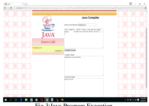
Fig 3:Java Program Execution.

In figure:2, web based programming environment is provided for the execution of JAVA,C,C++ and C#.NET programming languages.